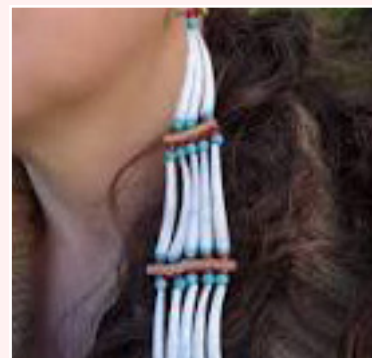
Dentalium Shell Earrings, Etsy

What is a dentalium shell? How was it used in the past and how do we use them today?