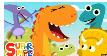
Video 3 Super Simple Songs 10 Little Dinosaurs