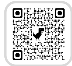
The Denali Pterosaur Molly of Denali

Scan the QR code. Enjoy the clips again!