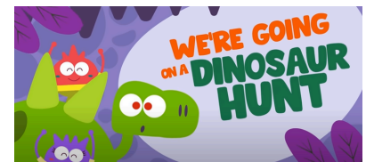
Video 2: Kiboombers