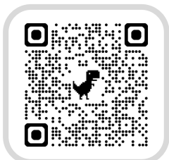
Dinosaur's in Denali CHILD Culture Clip