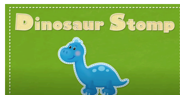
Video 1: Mother Goose Club

Choose Your Favorite *Click an image for the link*